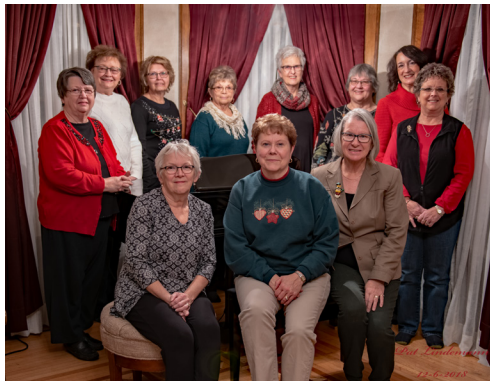
2019 GFWC Clio Club Members

Motto: While we live, let us continue to learn.